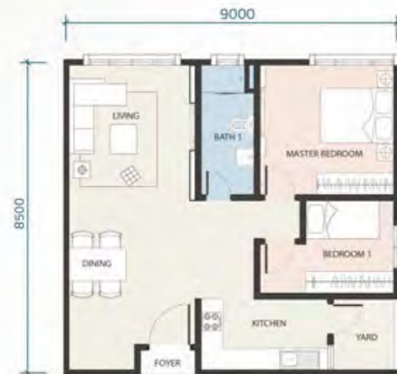
TYPE C | 823 sf