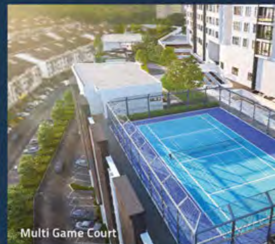
Multi Game Court