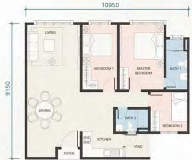
TYPE B | 1,012 sf