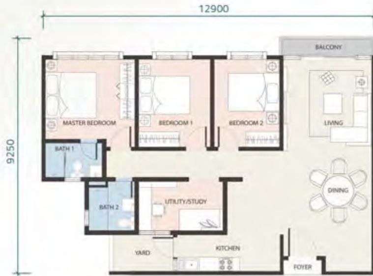
TYPE A | 1,128 sf