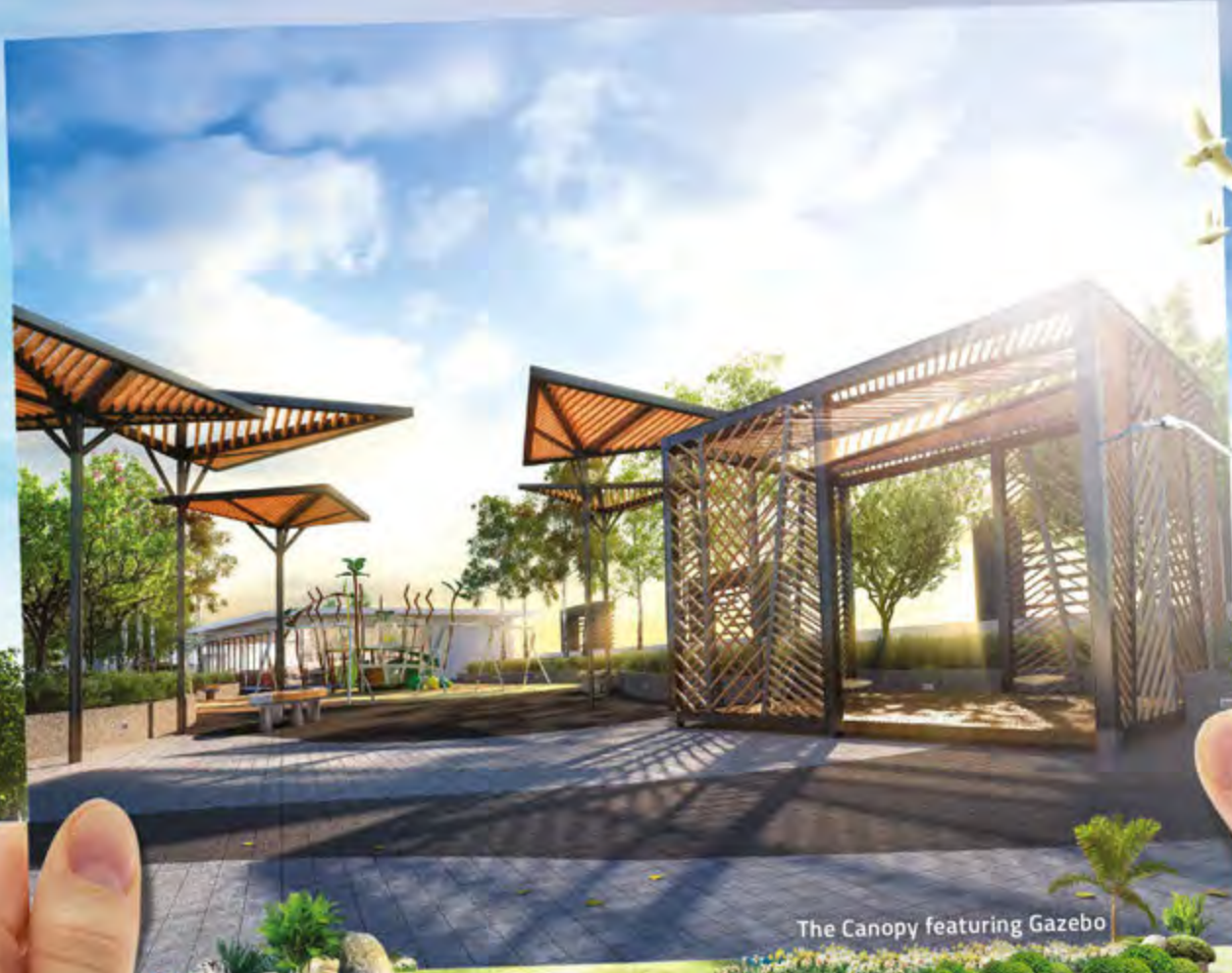
The Canopy featuring Gazebo