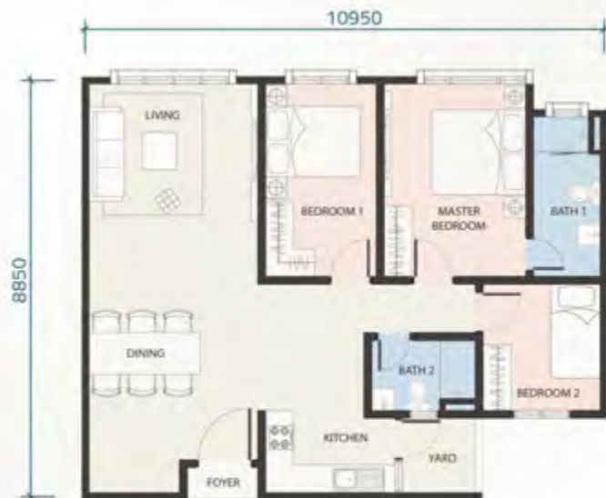
TYPE B1 | 982 sf